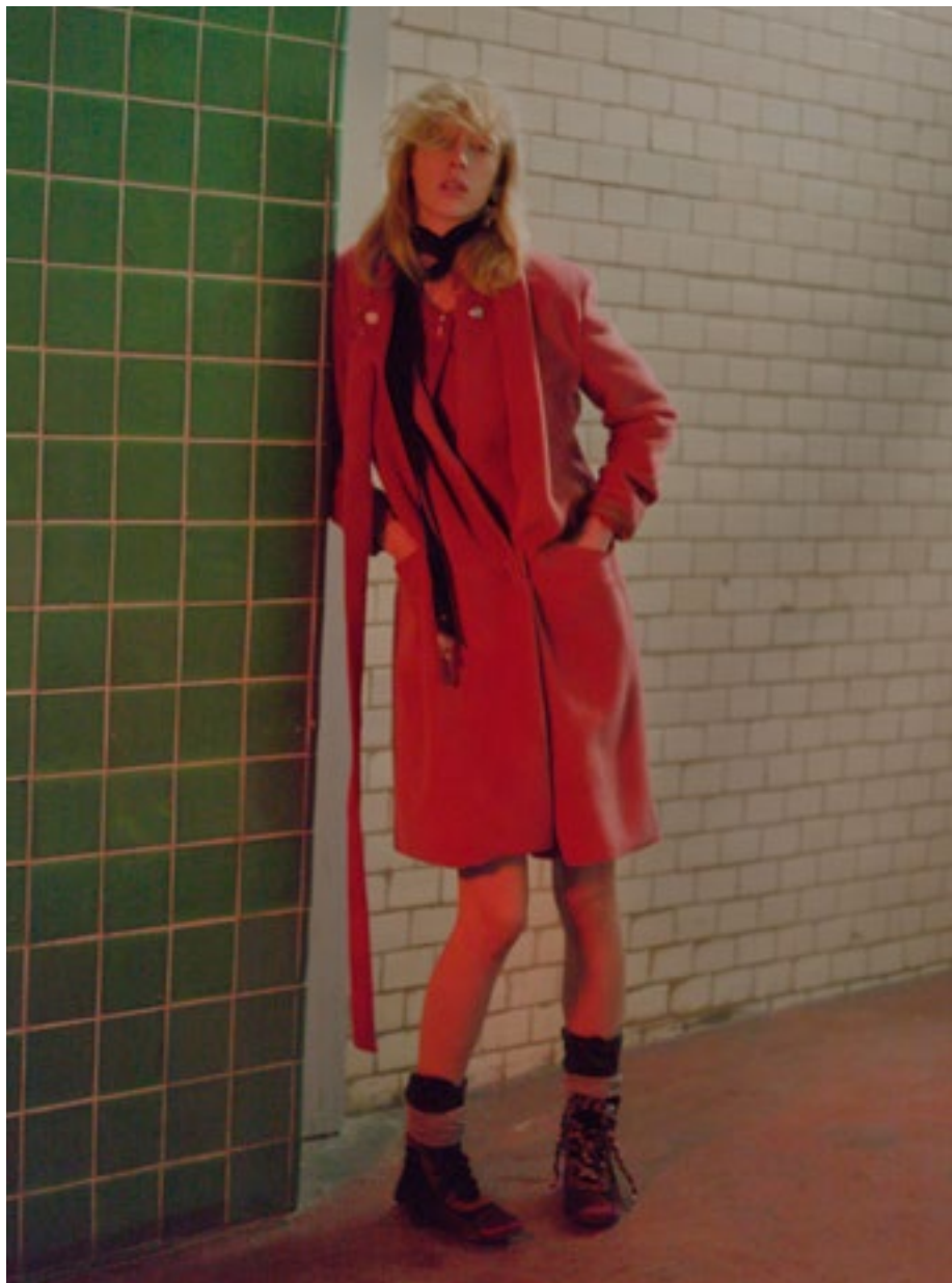
Turtleneck & Coat: STARSTYLING