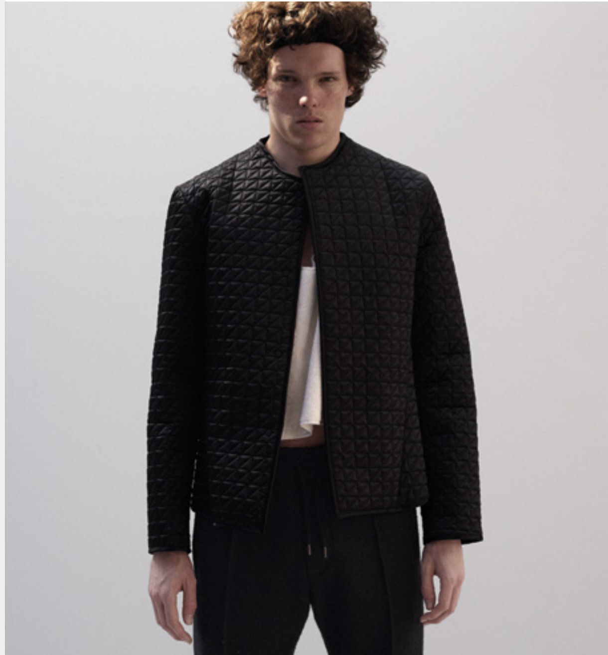
LEFT • T-SHIRTS: VERSUCHSKIND | JEANS: STAHL CORPORATION RIGHT • TANKTOP & HEADBAND: TATA CHRISTIANE | JACKET: STAHL CORPORATION