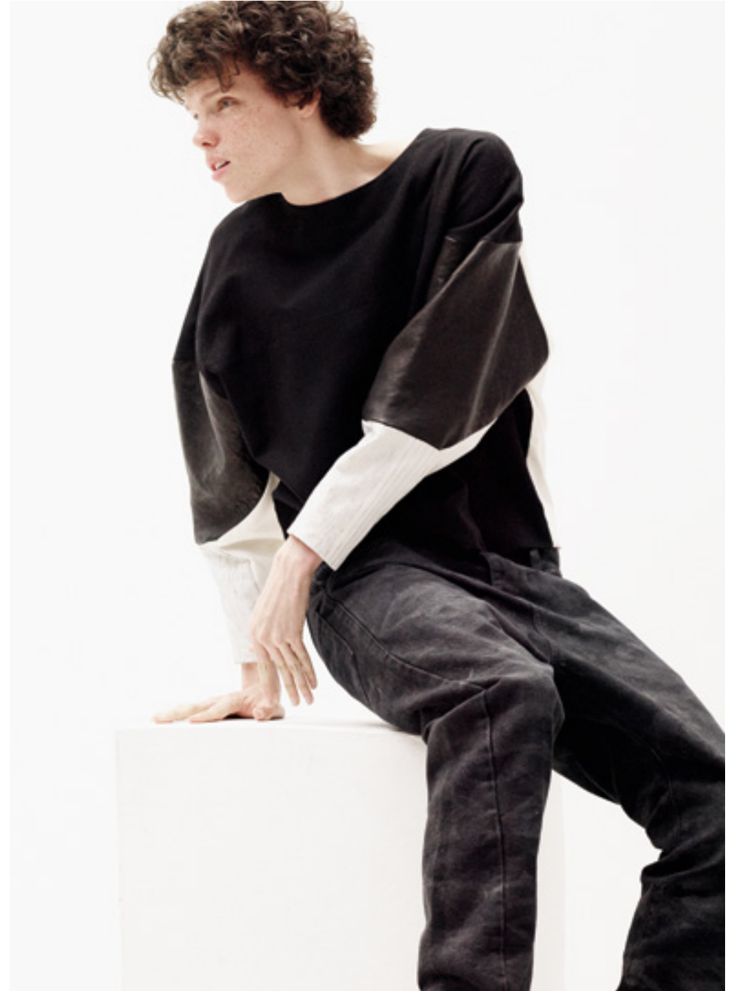
RIGHT • SWEATER: BLANK ETIQUETTE | JEANS: VERSUCHSKIND