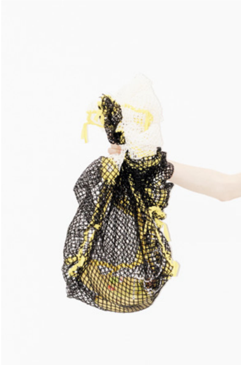
LEFT • CAPE: TATA CHRISTIANE